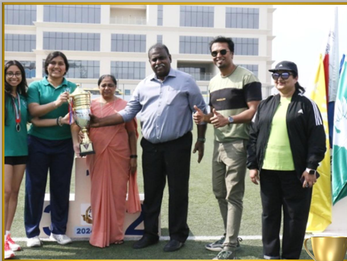
Girls Overall Champions