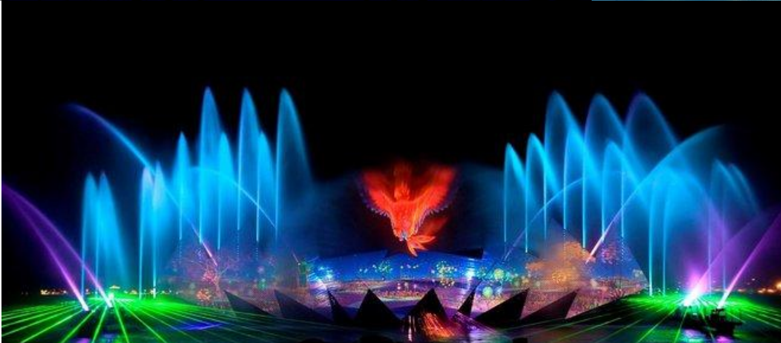
Wings of Time. A fitting end to your day out at Sentosa, this spectacular show about friendship and courage is staged nightly. Be wowed by spellbinding laser, fire and water effects set to a majestic soundtrack, complete with a jaw dropping fireworks display.